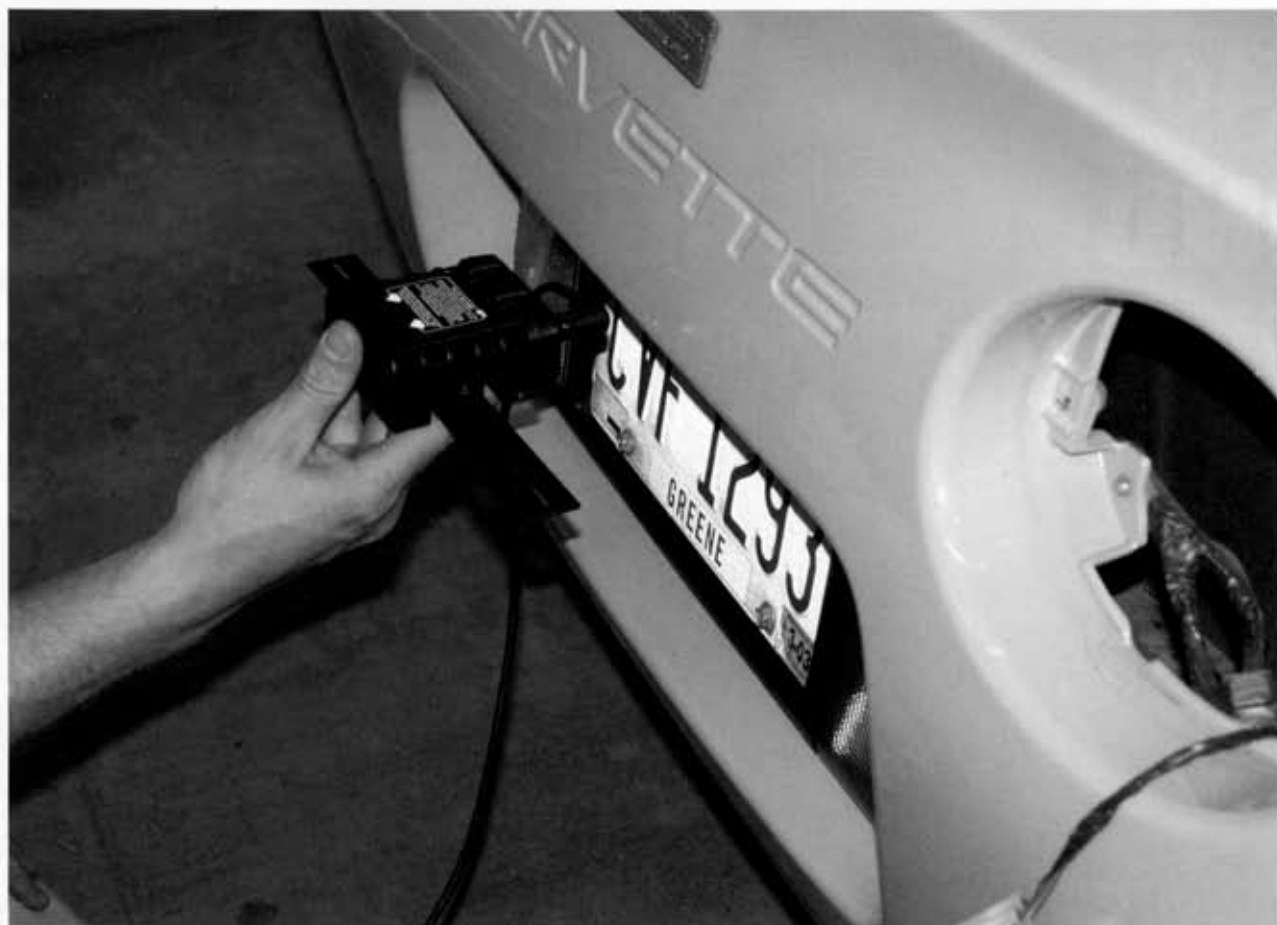
Rear-mounted hardware duplicates the front effort. The Laser DefuserPlus box is the only exterior sign of K40 presence.

(K40 2000 model units only). A volume knob on the activation unit allows you to adjust the audio alerts.