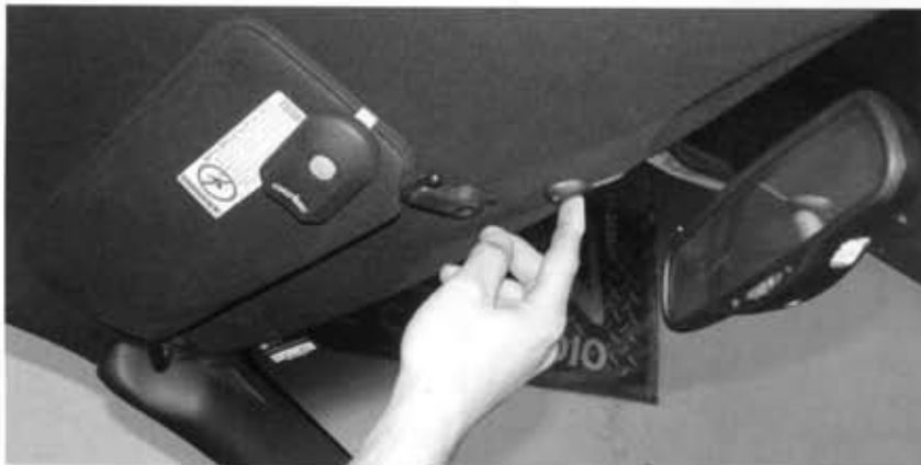
K40's Warning Pods, which each house an LED and Piezo speaker for visual and audio alerts, were mounted in the headliner and attached with Velcro® strips so they can be removed when the vehicle comes off lease.